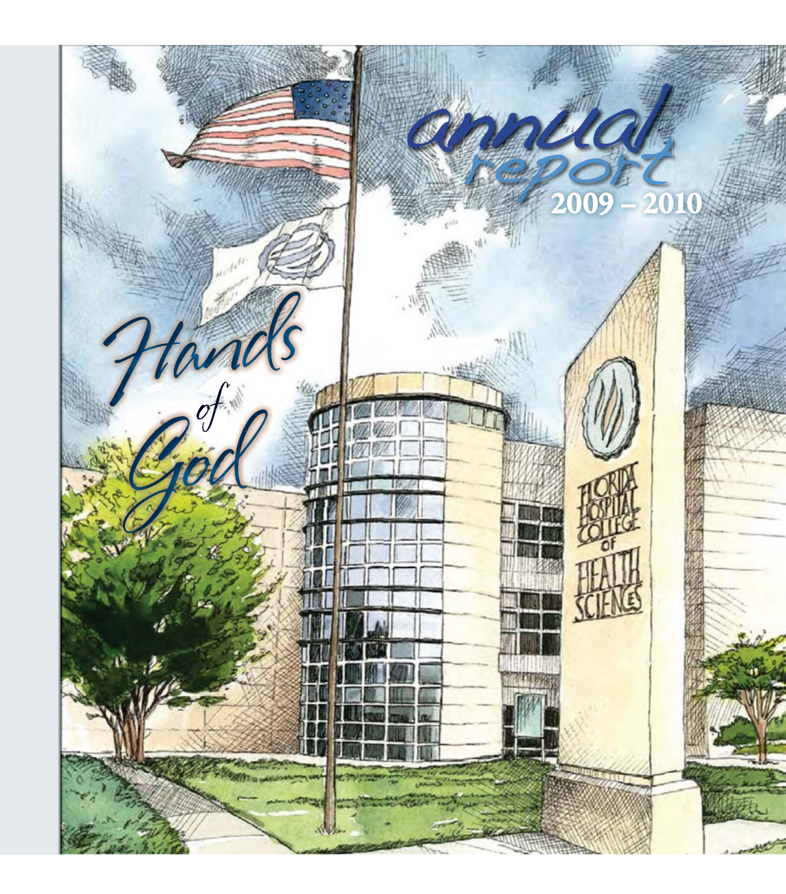
N U R T U R E EXCELLENCE SPIRITUALITY STEWARDSHIP